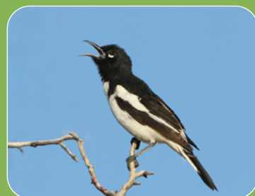
Eyrean Grasswren, Crimson Chat, Chestnut Quail-thrush, and Pied Honeyeater.