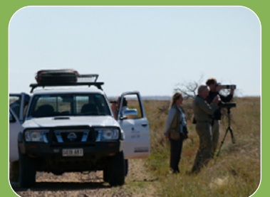
Striated Grasswren, Band-ed Stilt, Mallee Emuwren, and Malleefowl.