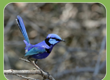
Short-tailed Grasswren, Mulga Parrot, Thick-billed Grasswren, and Splendid Fairy-wren.