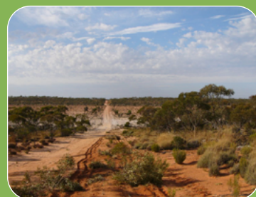
Grey Grasswren, Inland Dotterel, Regent Parrot, and Pink Cockatoo.