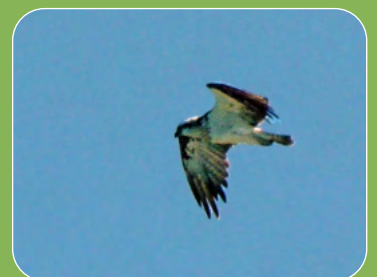
New-Holland Honeyeater, New Zealand Fur Seals, Glossy Black-Cockatoo, Scarlet Robin, and Eastern Osprey.