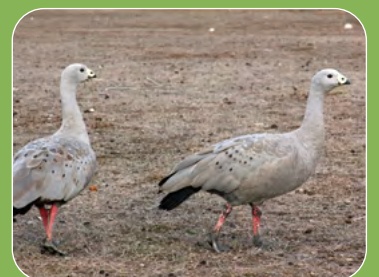
Crested Tern, Koala, Tammar Wallaby, and Cape Barren Goose