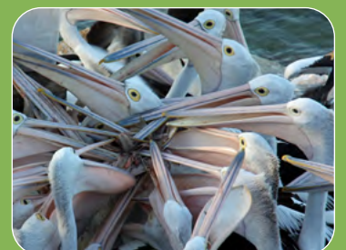
Western Whipbird, Crimson Rosella, Black-faced Cormorant, Fairy Tern, and Australian Pelican.