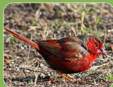
Yellow-tinted Honeyeater, Buff-sided Robin, Varied Lorikeet, Northern Rosella, and Crimson Finch.