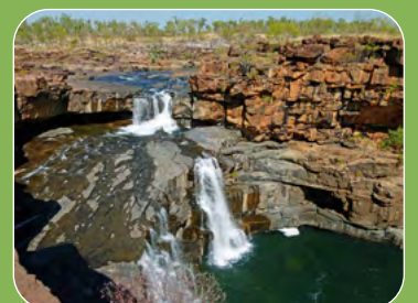
Asian Dowitcher, Red-headed Honeyeater, Northern Shrike, Black-necked Stork, and Mitchell Falls (Day 5).