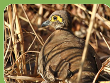
Purple-crowned Fairywren, Double-barred Finch, Black Grasswren, Kimberley Honeyeater, and Partridge Pigeon.