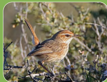
Orange Chat, Dingo, Grey Honeyeater, and Rufous Fieldwren.