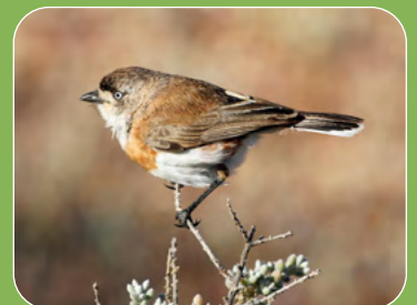
Thick-billed Grasswren, Cinnamon Quail-thrush, Black-breasted Buzzard, Gibberbird, and Chestnut-breasted Whiteface.