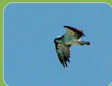
New-Holland Honeyeater, New Zealand Fur Seals, Glossy Black-Cockatoo, Scarlet Robin, and Eastern Osprey.