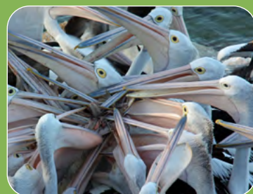
Western Whipbird, Crimson Rosella, Black-faced Cormorant, Fairy Tern, and Australian Pelican.