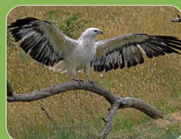
Orange-bellied Parrot, Beautiful Firetail, Blue-winged Parrot, and White-bellied Sea-Eagle.