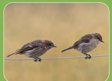
Tasmanian Thornbill, Forty-spotted Pardalote, Yellow-throated Honeyeater, Swift Parrot, and Dusky Robin.